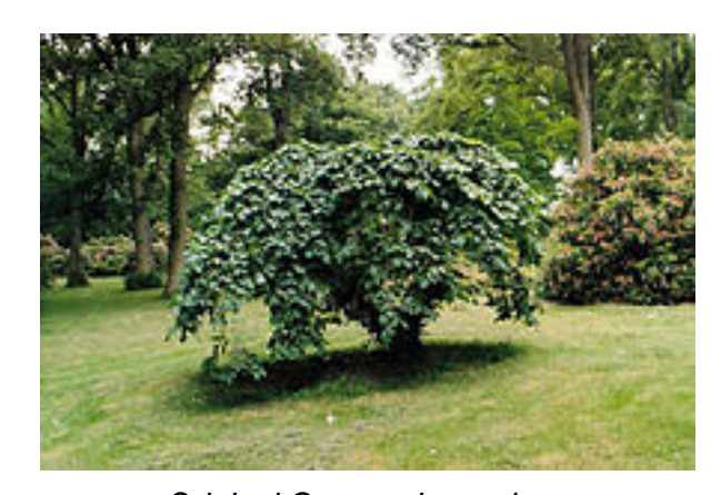
Original Camperdown elm

Ulmus is the ancient Latin name for the elm tree, and glabra means smooth or hairless – referring to the leaves of the tree. Ulmus glabra originates in the temperate areas of northern Europe. It is a hardy elm, suffering more from summer drought than winter cold. Established Camperdown elms in Scotland can endure temperatures as low as -25C without illeffect.