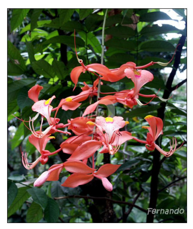
Amherstia nobilis – showing the extravagant flowers hanging from the long inflorescence.

Her name was commemorated by Nathaniel Wallich in the tree Pride of Burma Amherstia nobilis Wall. This is a tropical tree in the Fabaceae family and is the only member of the genus Amherstia . It has exceptionally beautiful flowers, indeed it has been described as the most beautiful tree in the world. It is widely cultivated because of its ornamental value in the humid tropics, but is very rare in the wild and has only been collected from its native habitat a few times. It is native to Burma (Myanmar), hence the common name.