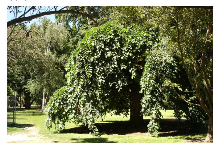
Botanic Gardens Camperdown elm

Because the Camperdown elm is a cultivar of Ulmus glabra it is very susceptible to Dutch elm disease and as a result the cultivar is now effectively extinct in Britain and Northern Europe. We are very lucky that we have splendid specimens in the Botanic Gardens and other older gardens around Christchurch. Have you counted the number in the Botanic Gardens?