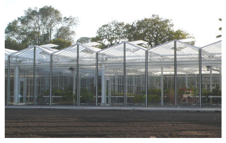
The alluring view of the plants in the new Botanic Gardens nursery

There have been exciting changes since Christmas at the heart of the Botanic Gardens where the new Visitor Centre is being constructed. Visiting today you would see the new building clearly from many different angles never seen before: the high perimeter fence has gone (though there is still a chain-link fence around the construction site for public safety), and the old nursery building and remaining greenhouses have been demolished. Most recently, temporary staff offices have been removed. Now there is a glorious vista from under the tree canopy near Cuningham House and the Rose Garden towards the gleaming glass and steel structure that has grown into its final form over the summer.