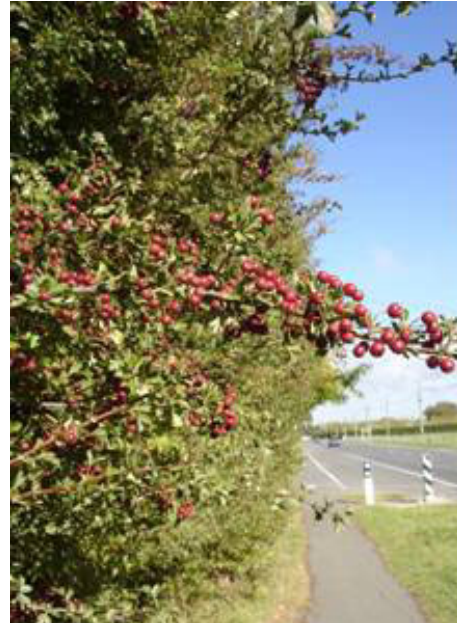
Hawthorn hedge with haws, Cashmere Road

Hawthorn is commonly seen in and around Christchurch. It's quite noticeable in the autumn with its red leaves and haws. There are, for example, some large hawthorn hedges along the old Tai Tapu Road, Cashmere Road and Hendersons Road. There is a specimen labelled Crataegus oxyantha (should that be C. monogyna ?) in the lawn adjoining the Rollleston Avenue boundary of the Botanic Gardens near the Cashel Street gate and Curator's House.