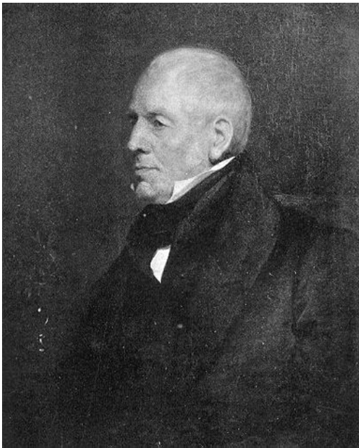
Archibald Menzies 1754- 1842

Archibald Menzies was born in Scotland. After working at the Edinburgh Botanic Gardens and qualifying in medicine and botany at Edinburgh University he joined the British Royal Navy as a surgeon/naturalist.