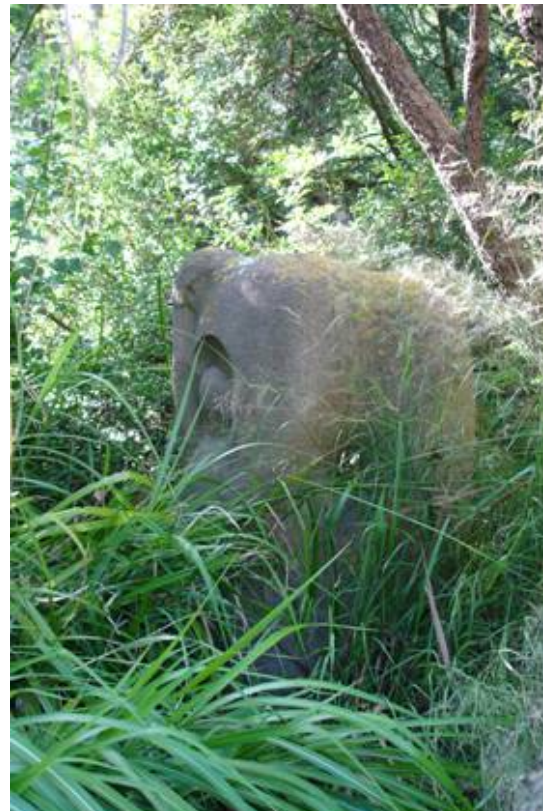
Maori rock carving beside Te Puna Ora

Early Maori found an abundance of artesian water on the Canterbury plains. It was valued for its purity and sweetness by Maori and European settlers alike. Water is a gift of life from the earth mother, Papatuanuku, and the sky father, Rangi, and is essential for healthy growth and regeneration of all life. Water ceremonies are ancient in origin, worldwide. Springs in Britain and Europe became places of pilgrimage (Holy Wells) and were dedicated to Celtic goddesses of arts, crafts and fertility. Later, Christian saints were adopted. Today, in parts of the world, tributes of gold and silver coins are made at artesian springs.