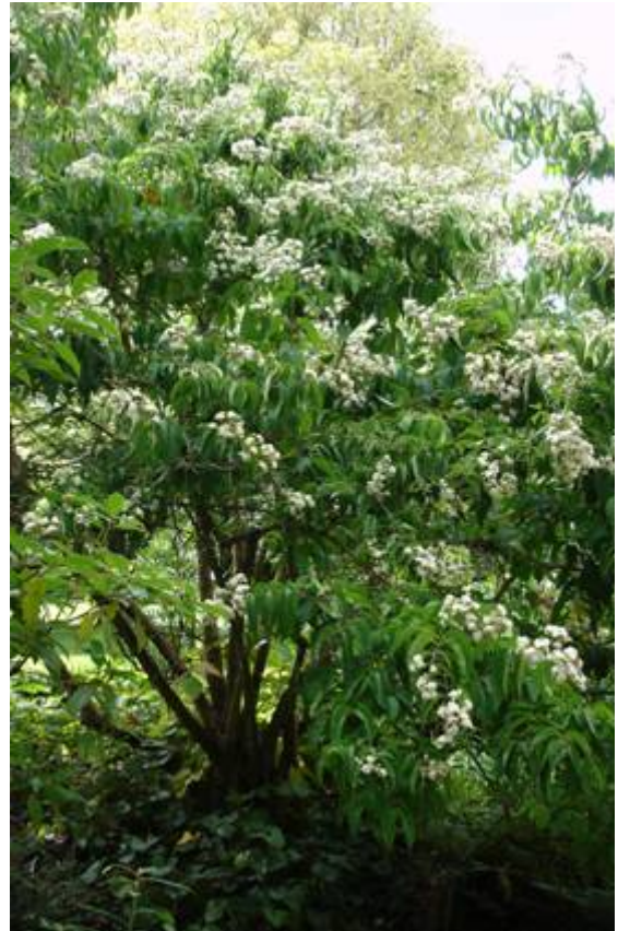
Heptacodium jasminioides in primula garden

not the case. Remember he worked with herbarium material and the plant was not as yet in flower. By mistake he took the top of the inflorescence for another bud - hence 7 flowers, and Heptacodium became its name.