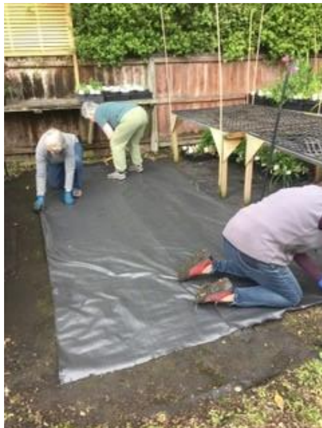
Figure 3: Tuesday's Propagating Team, Bottoms up, Hard at Work.

In the last few weeks, the Tuesday group have been hard at work rearranging benches, laying new weed mat, and extending the watering system.