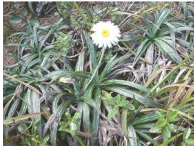
Figure 7: Celmisia graminifolia .

Having successfully germinated both species, Luke Martin, Native Garden Curator, grew them on and then joined the team to plant them as figure 8 shows. More planting is due to take place and with the great support of the team at Travis, we are confident these species should flourish and be secured for the future.