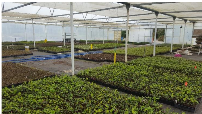
Figure 11: Headford Propagators Shade House.

Our first day in Dunedin was with the Dunedin Botanic Garden team who were hosting us for the next couple of days. Here we met other trainees from Invercargill, Gore, Dunedin and Queenstown. We then had tours of different collections of the Gardens. It was interesting meeting with different collection curators while listening to them tell us about their area and routines. We went to the Rhododendron dell and were amazed by the vibrant colours of the Rhododendrons and Azaleas. We all noticed the razor-sharp garden edges and lush lawn which really made the garden pop out. On display was the world's smallest Rhododendron, Rhododendron calostrotum ssp. Keleticum . It only grows from 2.5 - 40cm high and is naturally found at altitudes of between 3400m to 4600m in Tibet.