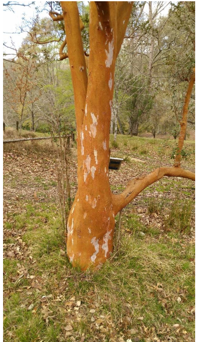
Figure 19: Orange bark myrtle.

The orange bark myrtle is a member of the Myrtaceae and related to the eucalyptus, manuka, kanuka, pohutukawa and guava. Small white flowers smother the tree over summer. The fruit is small and black, sweet and edible, but it takes many to make a meal. Blackbirds and kereru readily eat them, and seedlings come up occasionally in the park.