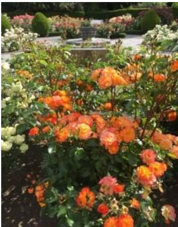
Figure 1: Roses Blooming in the Formal Rose Garden.

If you, like me, are in need of refreshment I recommend a visit to our beautiful Botanic Gardens. I took some time today in the late afternoon and gravitated to the splendid rose garden. This haven was still busy with people admiring the booms.