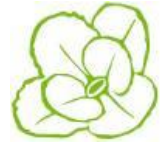
Veronica laudaiana Sun Hebe Endemic to Banks Peninsula Christchurch

I then gravitated across to the woodland garden and in the evening light the three paper bark maples ( Acer griseum ) looked spectacular.