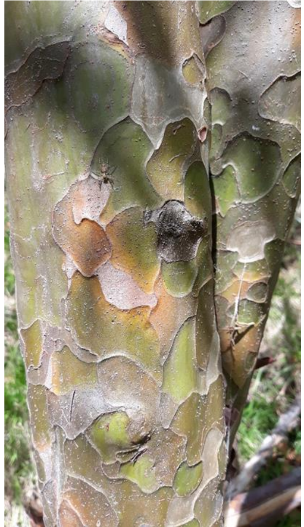
Figure 21: Chinese quince bark.

Chinese quince is a small deciduous tree or large shrub with an attractive form, large fruits and interesting bark. The flowers are cup-shaped, fragrant and pink. The fruit are huge oval quinces up to 17 cm across with a sweetly fragrant aroma. The Chinese quince is closely related to the European quince Cydonia oblonga but differs because of its serrated leaves and lack of fuzz on the fruit. Fruits are edible off the tree or may be used in jams and syrups.