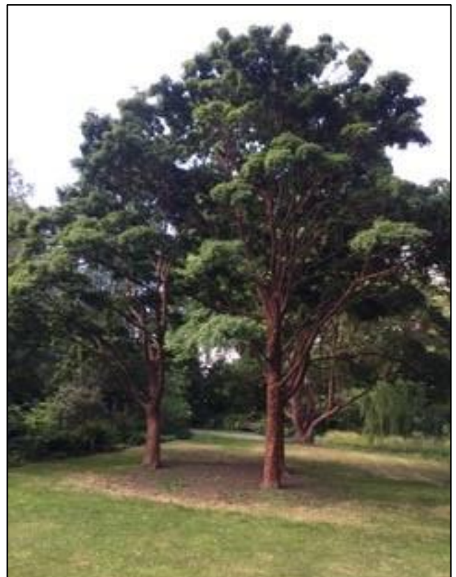
Figure 2: Paperbark Maples in the Woodland Garden.

I would like to welcome new Friends who have recently joined our ranks. We currently have 162 members: 3 affiliate, 37 Family, 105 individual, 9 life and 8 student members.