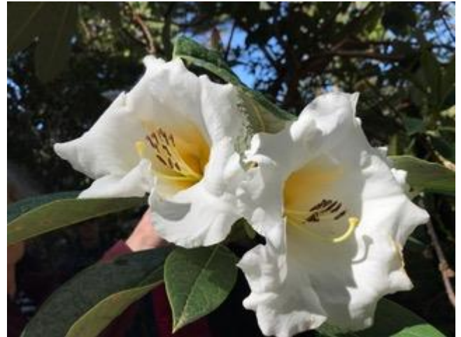
Figure 17: Rhododendron 'White Waves'.

Many of the group finished the morning with a picnic in the grounds of Orton Bradley or lunch in the café.