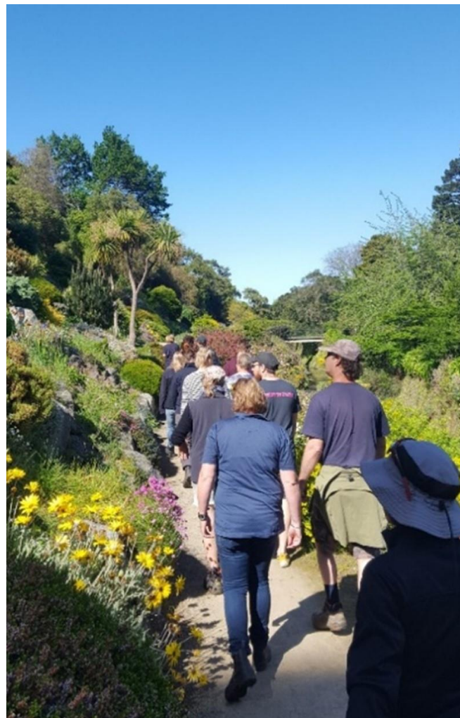
Figure 12: Group Tour Through the Rock Garden.

garden. The topography of the rock garden was vastly different to what we have in Christchurch, with the collection based on a steep hillside. This made for a more natural feel to the garden, as if we were halfway up a mountain. In the afternoon we got to mingle further with the other apprentices, where we learnt more from the Dunedin apprentices and their program.