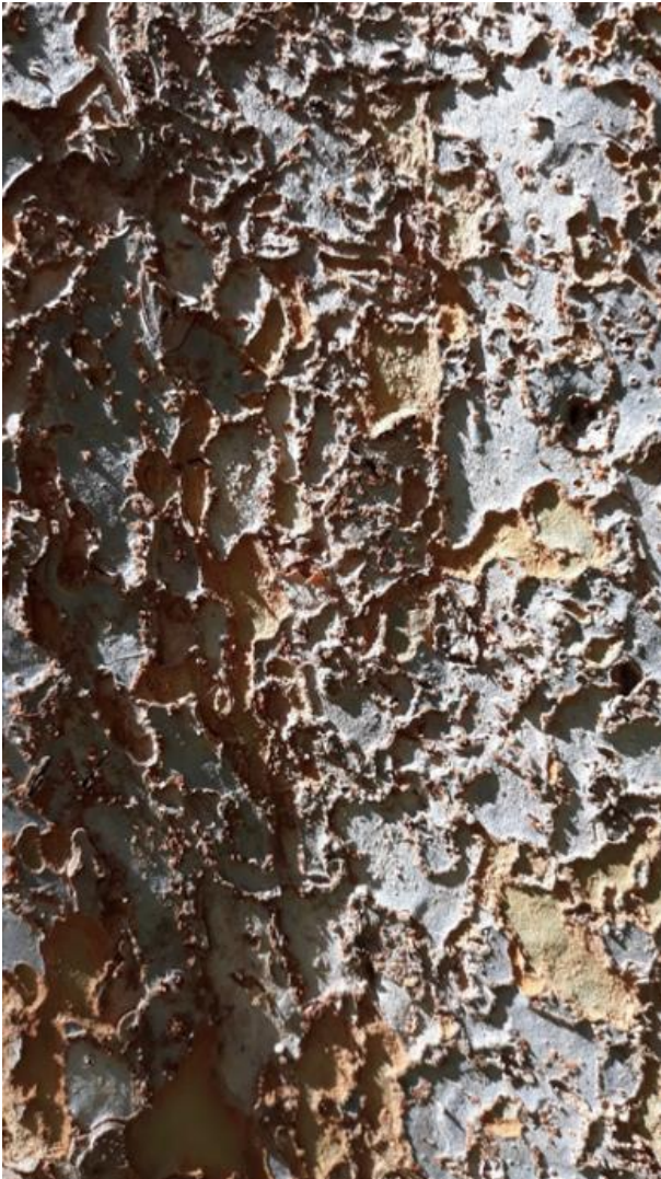
Figure 20: Close up of Chinese elm bark.

The wood of Chinese elm is considered the hardest of the elms. Owing to its superior hardness, toughness and resistance to splitting, Chinese elm is said to be the best of all woods for chisel handles and similar uses.