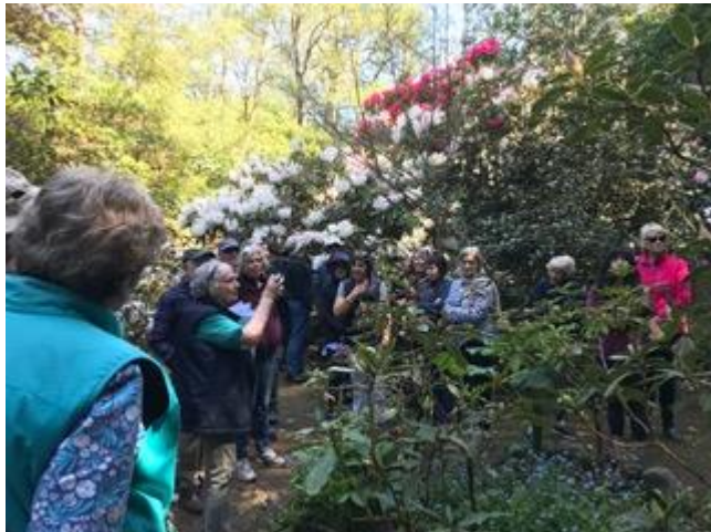
Figure 15: Friends Visit the Rhododendron Garden at Orton Bradley Park.

It has certainly been a wonderful spring for Rhododendrons. In mid-October, 30 Friends were fortunate to be guided around the Canterbury Rhododendron Society's 35-year-old show garden at Orton Bradley by several of their enthusiastic members. It was a real treat to see so many unique and beautiful specimens and to learn about the different lineages. The range of species and profusion of flowers entranced everybody.