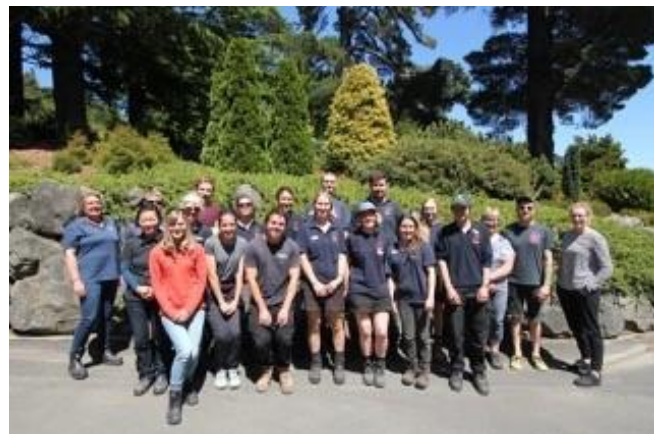
Figure14: Trainees from Christchurch, Dunedin, Gore, Invercargill and Queenstown at Dunedin Botanic Gardens.

We would like to thank each place and group which supported our trip, we gained a great deal of knowledge from each place we visited. We made some fantastic connections and had an enjoyable time.