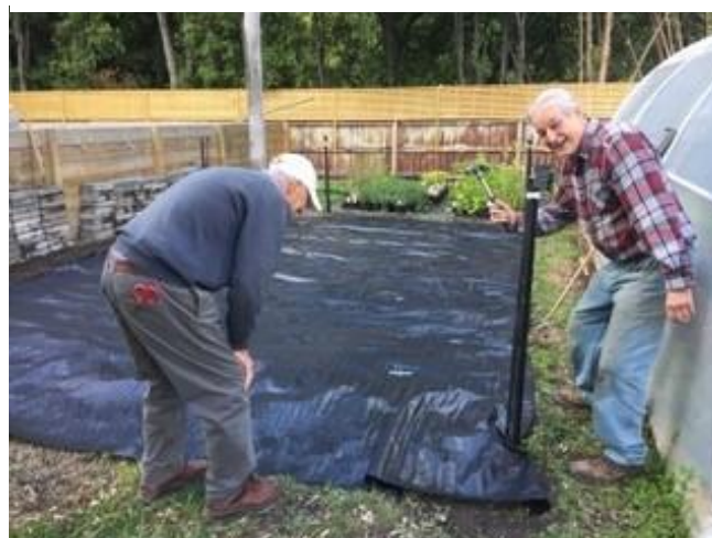
Figure 4: Laying New Weed Mat.

I would like to thank the 16 Volunteers working in the different garden sections. This is a wonderful commitment and numbers of volunteers are growing steadily. I know that the Curators are very grateful for the help. The scale of the gardens means that there is always plenty to do, even if it is just dead-heading roses. If you would like to volunteer in the Gardens, please contact Jane Cowen-Harris who is doing a sterling job coordinating these volunteers. Thank you, Jane.