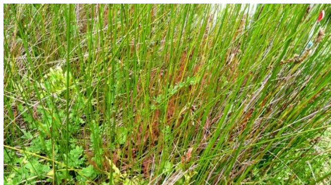
Figure 6: Drosera binnata ; Growing Amongst the Grass in the Travis Wetlands. Image from INaturalist NZ.

Last season with the help of volunteers, staff and supporters of Travis Wetland we collected seed of Drosera binnata , one of the larger native sundews and Celmisia graminifolia , a swamp daisy. These are two locally rare species within the Travis Wetland — the only place they naturally grow in the Christchurch area. Both only have a low number of plants remaining and we wanted to help boost the population with additional planting.