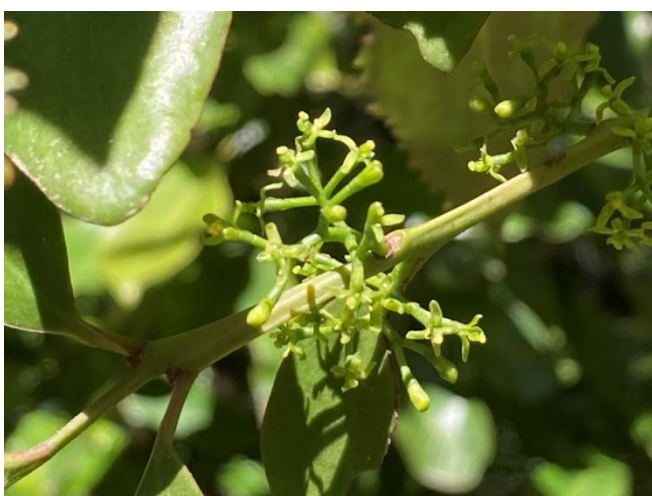
Figure 18: Ileostylus micranthus buds.

In May 2016 we carried out a trial to find the establishment rate of Ileostylus micranthus (green mistletoe) on a range of different host plants in the Christchurch Botanic Gardens. Ileostylus micranthus seeds were sown on 28 different host plants: 19 native and 9 exotic. We recorded an overall establishment rate of 8.96% (establishment determined by development of the first true leaves when the haustorium penetrates the host). The establishment rate on native plants was 12.5% compared to 1% for exotic plants.