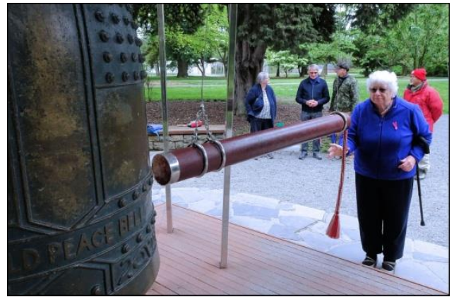
Figure 23: Ring Ceremony, November 10 th 2020.

Malala Yousafzai is a young Pakistani girl who was shot in the head by the Taliban in October 2012 when a gunman ambushed the school bus she was riding on. Taliban wanted to prevent her from promoting education for girls. Miraculously she survived. Having been stabilised in local hospitals, she was flown to Birmingham, England, for further delicate surgery at Queen Elizabeth Hospital. Malala subsequently won the Nobel Peace Prize, becoming the youngest ever recipient, and established the Malala Fund to educate all young people, especially girls. Education is an exceptional path to Peace. Therefore, Malala is undoubtedly a peacemaker.