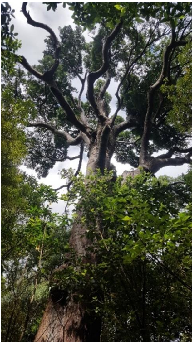
Figure 13: The Thousand-Year-Old Matai at Glenfalloch.

Nestled amongst a beautiful back drop of the Otago peninsula, Larnach Castle was an impressive structure overlooking well-maintained gardens. There were unusual native plants such as white kakabeak ( Clianthus puniceus 'Albus'), mountain cabbage tree ( Cordyline indivisa ) and giant flowered broom ( Carmichaelia williamsii ). Scattered around the grounds of the castle were statues of various characters and scenes from Alice in Wonderland which made for an interesting walk.