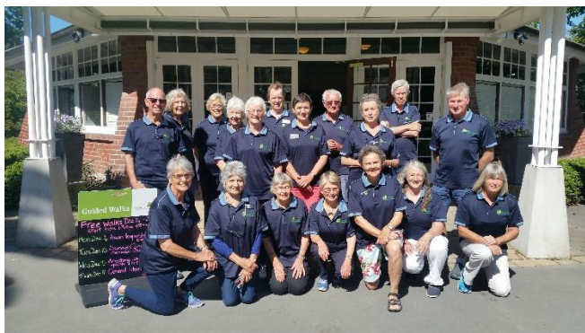
Figure 9: Volunteer Guides Outside the Kiosk.

Covid-19 dramatically changed the landscape for our team of Volunteer Guides at the Botanic Gardens. For many years prior to March 2020 our Guides offered daily 90-minute walks around the Gardens for a six-month season of October through to April; these attracted mainly overseas tourists with only a few locals. In addition to these daily walks there have been regular group bookings for guided walks, again catering largely for overseas visitors.