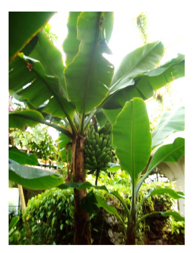
Banana in Cuningham House.

Among the plants many of us didn't recognise was the familiar sight of the towering herbaceous banana in full fruit. The ripe Musa acuminata 'Cavendish' is a delicious treat for the staff, and we know from watching professional tennis players, it is an excellent source of potassium for sustaining energy levels.