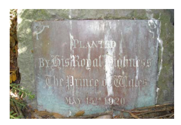
Plaque at base of kauri tree

was the most naturally planted tree ever planted.