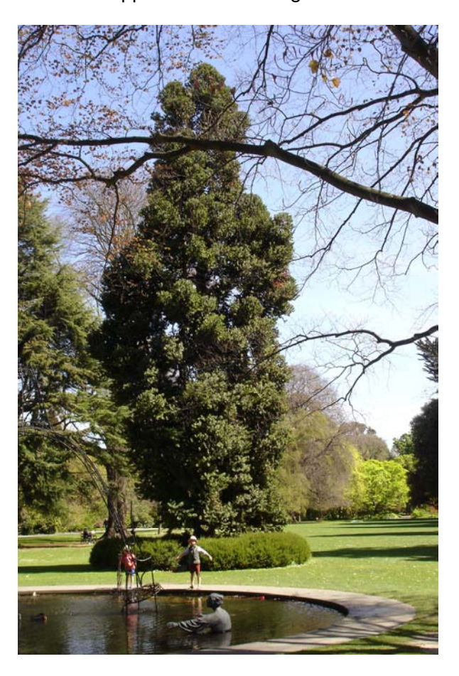
Kauri tree today on the Archery Lawn.

lower branches and assume their adult form consisting of a thick, straight trunk, clear of branches up to a considerable height above which the upper branches hang down.