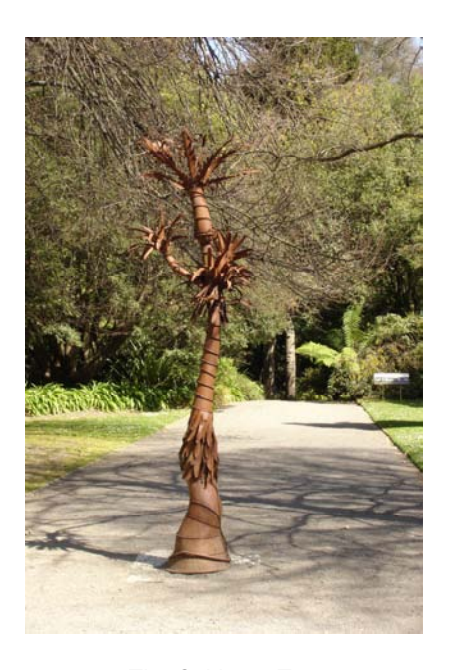
The Cabbage Tree

The Cabbage Tree featured in a past Ellerslie Flower Show, following which it was hidden away behind the former Information Centre. Now, it is in a much more prominent position between the central rose garden and the NZ native plant section where it can be more readily appreciated.